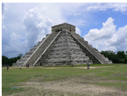
Chichen Itza pyramid in Mexico